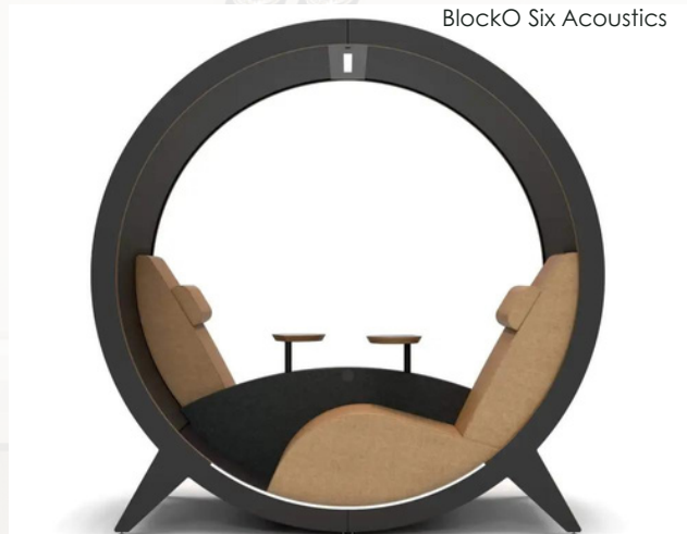
BlockO Six Acoustics

With a push to fully embrace sustainability, this years focus on carbon impact, wellness, and bettering the world around, is more important than ever. The details involved in making furniture better for our environment matters.