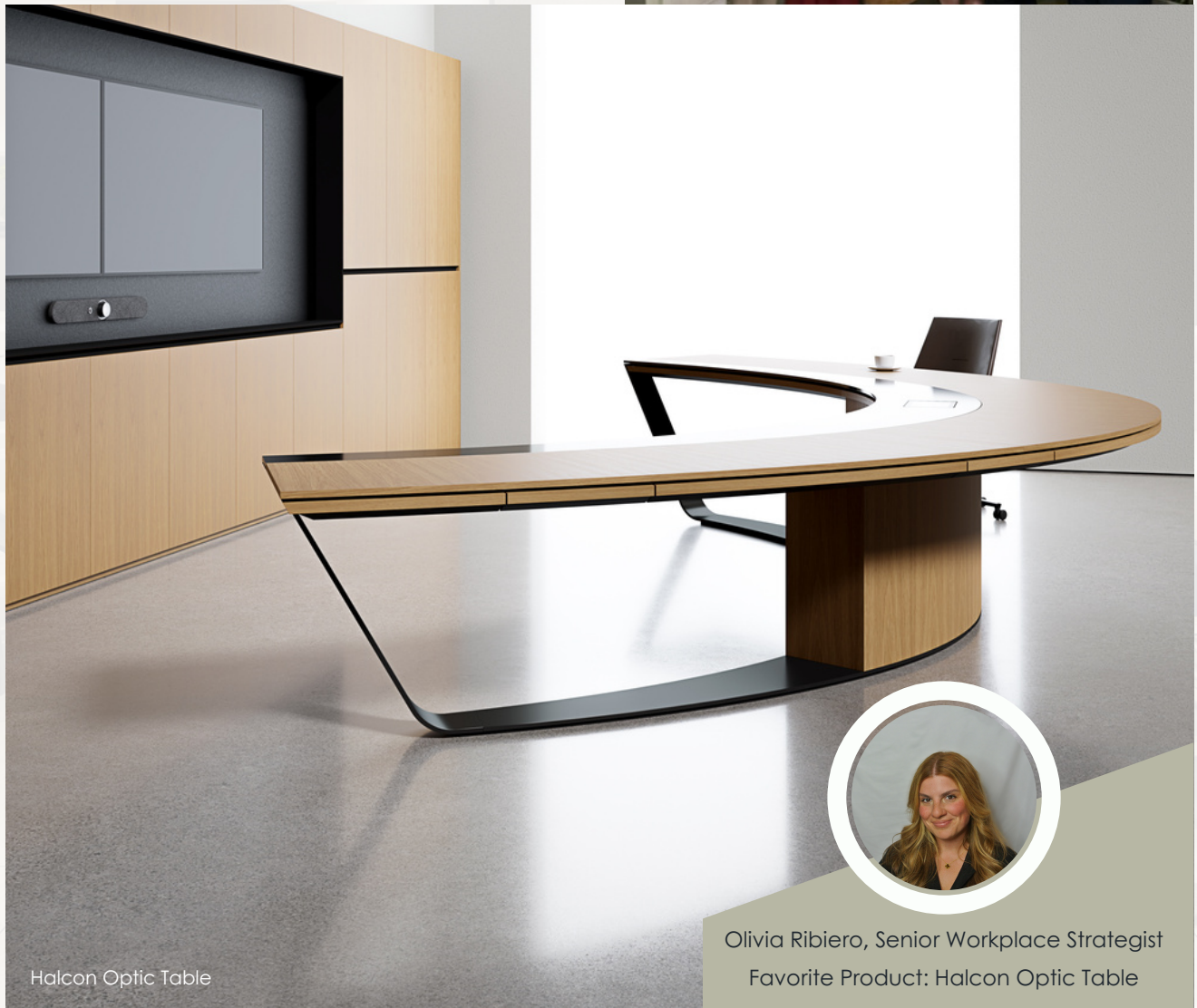
Halcon Optic Table