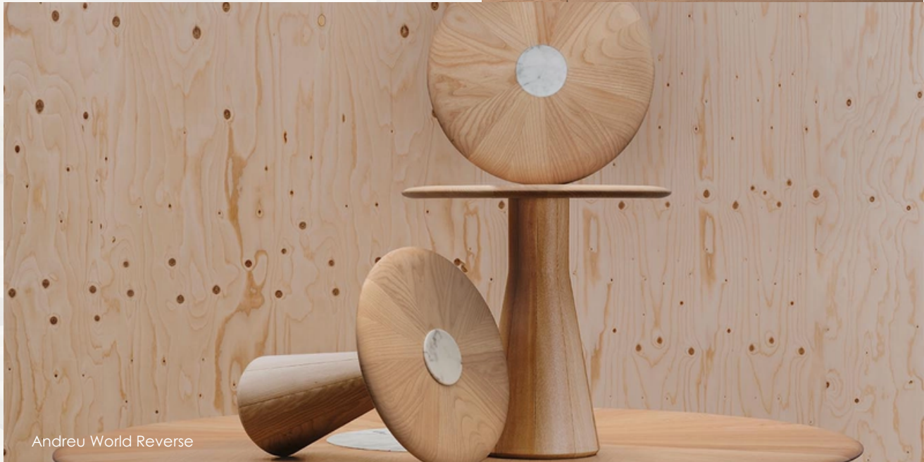
Andreu World Reverse