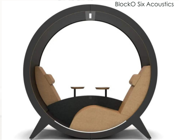
BlockO Six Acoustics

With a push to fully embrace sustainability, this years focus on carbon impact, wellness, and bettering the world around, is more important than ever. The details involved in making furniture better for our environment matters.