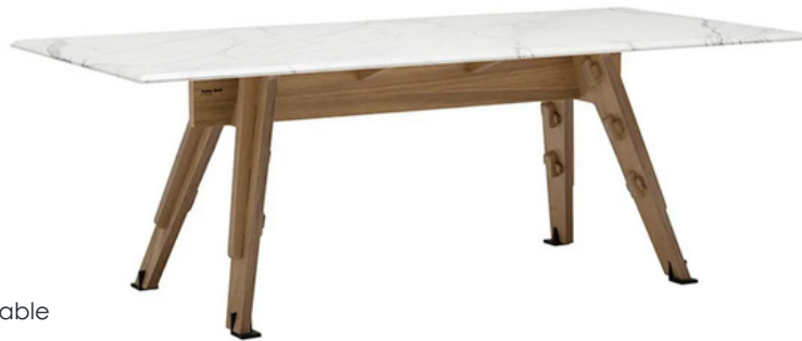
Andreu World Tamara Table