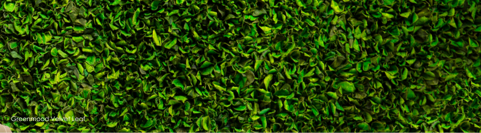
Greenmood Velvet Leaf