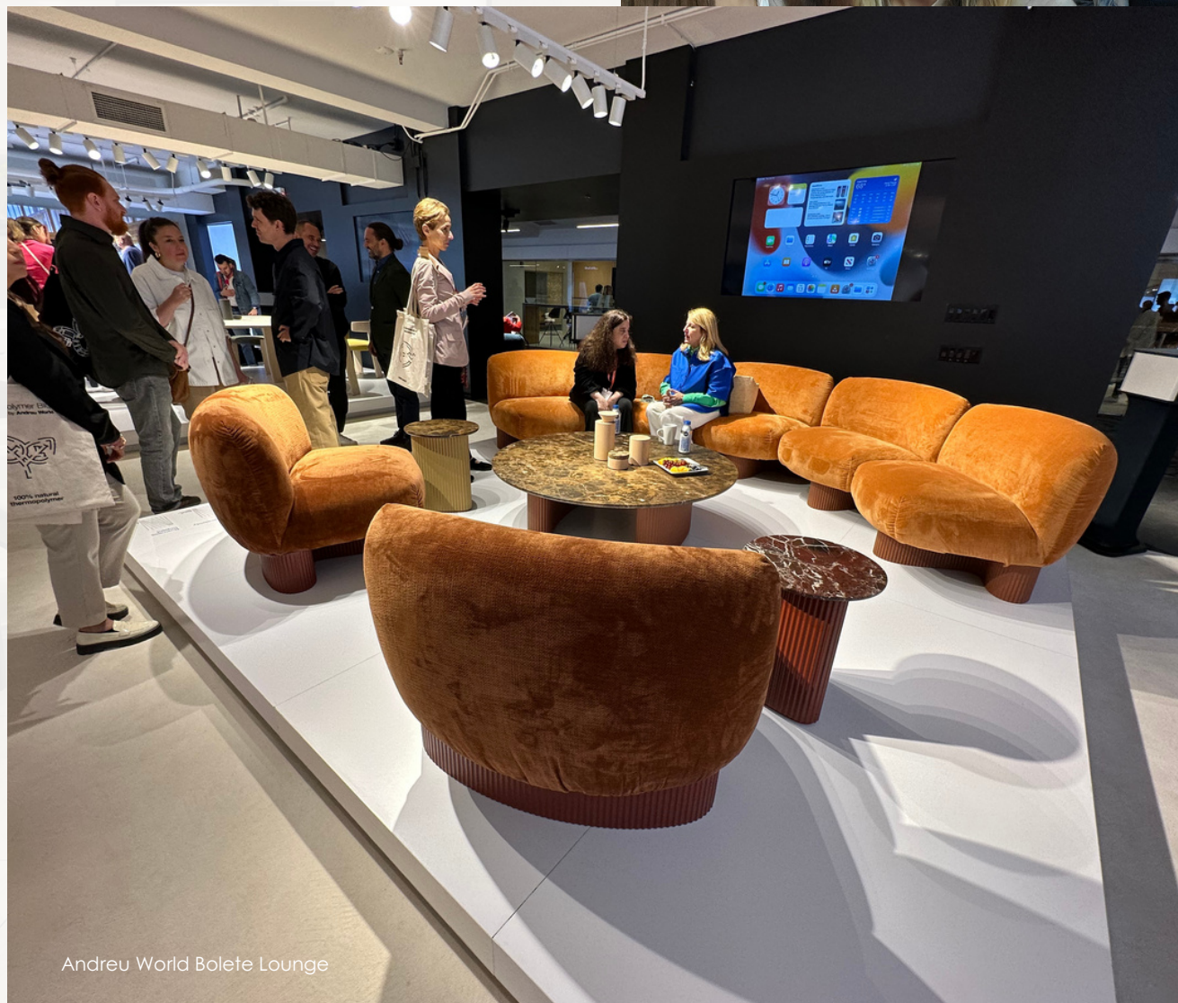
Andreu World Bolete Lounge