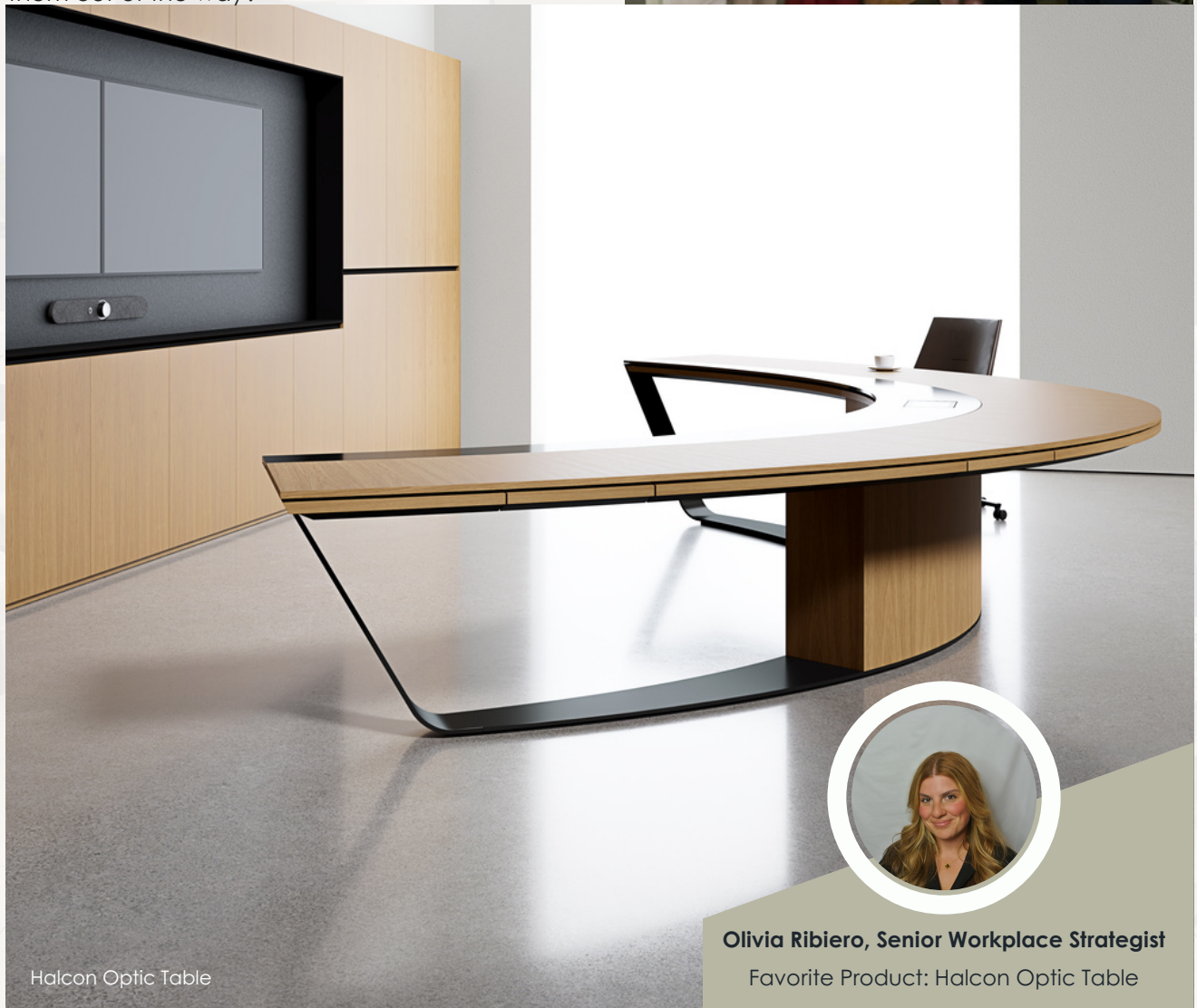
Halcon Optic Table