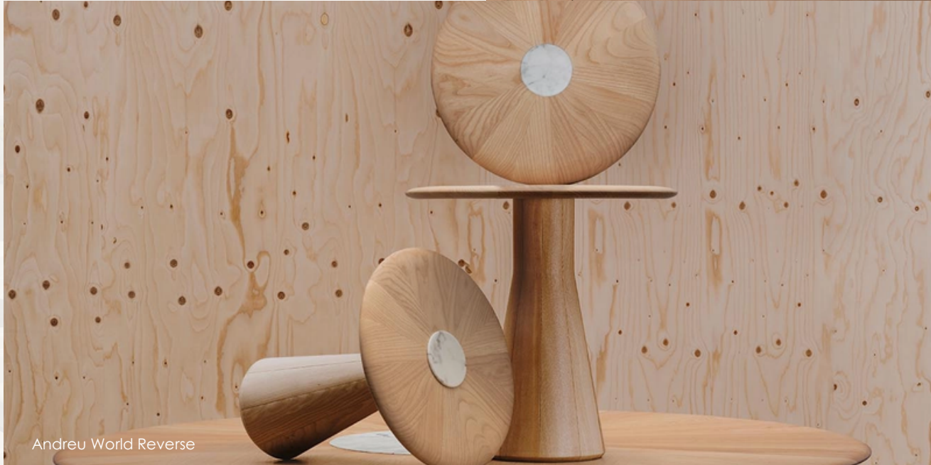
Andreu World Reverse