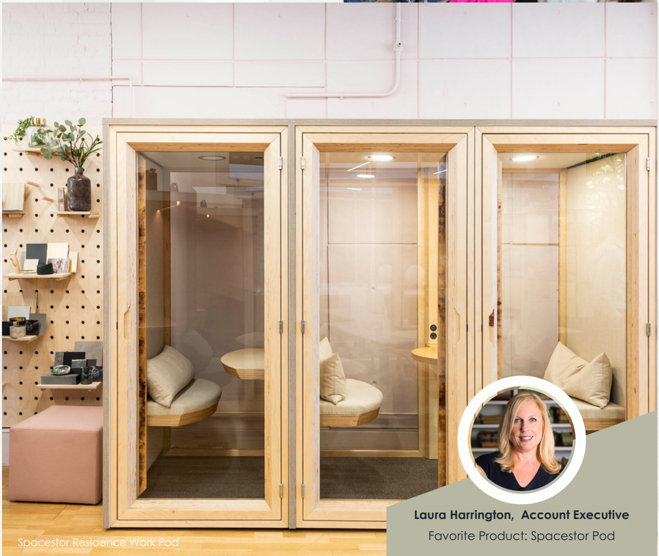
Spacestor Residence Work Pod