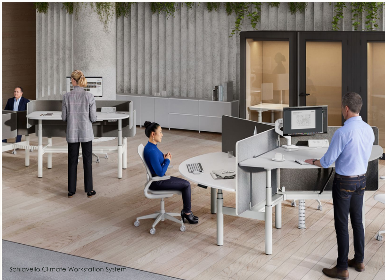
Schiavello Climate Workstation System